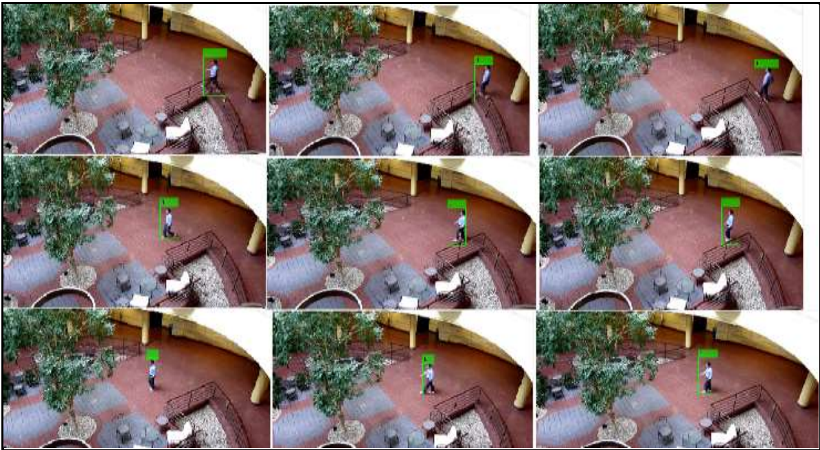
Figure (3): output frames from video-2