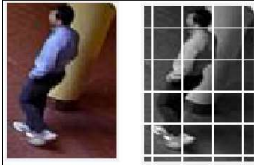
Figure (1): the division of template image into blocks

To compute the degree of similarity of two images, a comparison between each corresponding blocks of the images are achieved to compute the distance between their local histograms. . If the distance is smaller than a threshold then these blocks will be marked as similar blocks. For all the blocks in these images the summation of similar blocks will be the similarity metric between the two images. The computation of similarity degree is shown in the proposed algorithm (2).