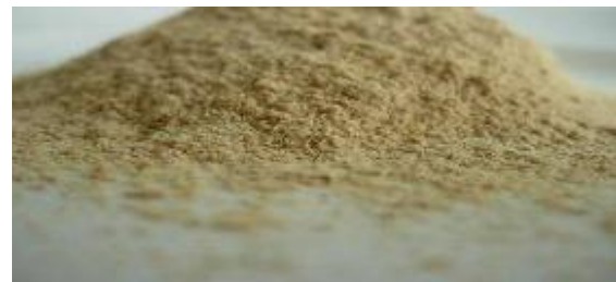
Figure 1: Coconut fiber powder [6]

Surfactants are unit compounds that reduce the physical phenomenon of a fluid, the interfacial surface tension between two liquids, or that between a liquid and a solid. Surfactants might work as detergents, wetting agents, emulsifiers, foaming agents, and dispersants. The drag-reduction mechanism by surfactant additives is still not fully understood, but it is mostly approved that drag reduction is related to network structures named micelles, in the surfactant solution. These network structures appear elasticity and prohibit the formation of turbulence and thus lower frictional drag [31].