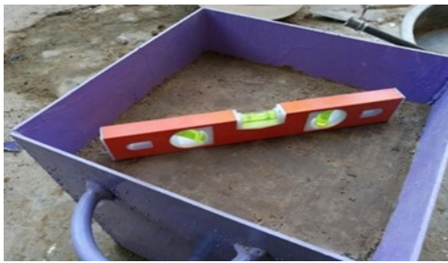
Figure 1: Show the bed of soil