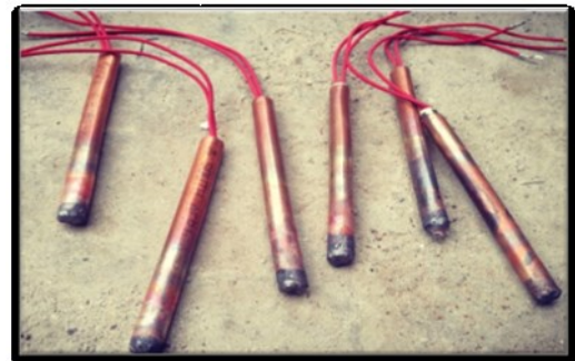
Figure 4: Heaters after covering