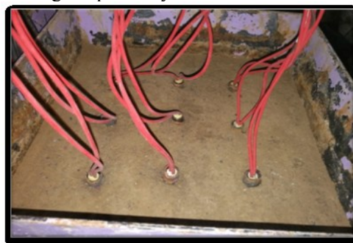
Figure 5: Electric heaters instillation

After the drilling of boreholes, the electric heaters of the same diameter and length were installed inside the boreholes as shown in Figure 5 and the electric power is switched on for six hours heating. The temperature inside the soil and at the center of pattern was measured by a thermo cable linked to the heat controls board that maintain the temperature at 400o C After completing the treatment, the heating system is extinguished and the soil model is left to cool for 24 hours, then samples were extracted and tested for determining the plasticity index.