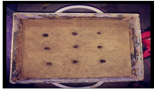
Figure 2: The borehole preparation