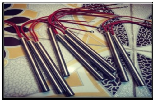
Figure 3: Heaters before covering

Electrical heaters were used in the experimental work with different number of heaters at any model according to the spacing used. A cartridge heater is a sturdy (electric resistance) industrial heating element (Joule) employed in the process of heating industry, often custom-made for particular watt density, based on its intended application. Being highly compacted, they reach a surface watt density of up to 30 w/ cm 2 . "Cartridge heaters seem structurally tubular heaters, but tend to have higher watt densities." A well-known application for these types of heaters is the plastic pellets that are melted to create molded plastic parts. This type was used for this study after it covered with a thin steel pipe to avoid the damage which may be happened when direct used in contact with soil. The length and diameter of heaters are 170 mm and 12.5 mm respectively as shown in Figures 3 and 4.