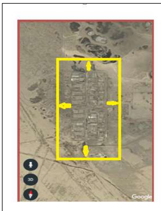
Figure 1: Sampling location in the study site

A composite soil samples were arranged by gathering nearby 1 kg of soil from the industrial zone (Area) in the city of Baghdad and the region surrounding the tanning factor, samples were collected at a distance (50, 500 and 1000) m in the four directions around the area of the factory. These samples were then taken from three deeps (0, 50 and 100) cm (Figure 2), by hand digging with a stainless steel spatula. The soil samples were air-drying, and passed through a (2mm) sieve for removing large debris and stones. After that, the soil samples were stored in polyethylene bags for additional analysis. Samples were digested using a combination of HCl and HNO 3 [14]. Heavy metals were tested using Atomic Absorption Spectrometry (model AAS 6300, Shimadzu, Japan) in laboratories of Environmental Research Center, University of Technology, Baghdad, Iraq.