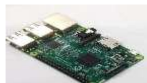
Figure 2. Raspberry pi 3 PC

The hardware and software used in the mini-model for practical experimentation can be matched with the components and layers of the Internet of things architecture, where the DHT11 sensor is similar to the first layer-sensing layer. The Wi-Fi is similar to the second layer Network layer or Transmission Layer. Moreover, Lambda function Layer as the Middleware layer or processing layer. In addition, the database is similar to the fourth layer application layer. In addition, the website, index .php is similar to the fifth Business layer.