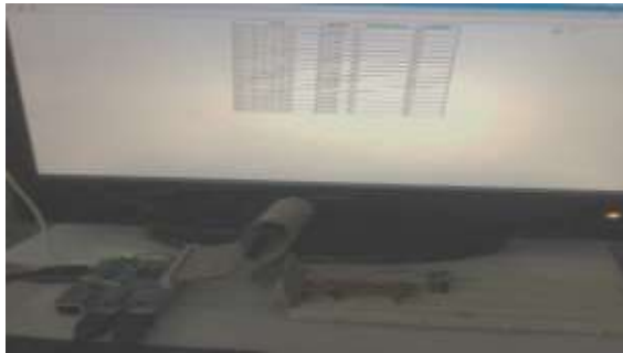
Figure 3: The Experiment