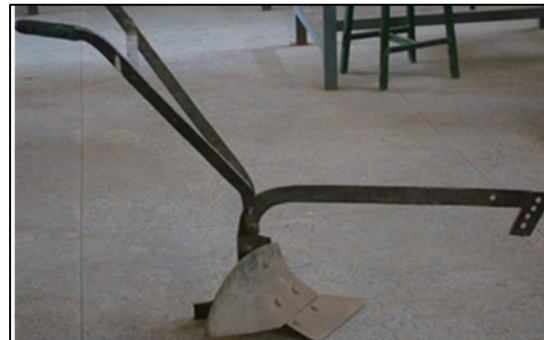
Plate2 :Single-furrow mouldboard plough