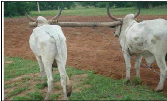
Plate1: Draught Animals Used for Field Operation

The field study was conducted between June-July 2020 cropping season at Modibbo Adama University, Yola, within the Savannah region, Yola area ( 9^{\circ} 14' N and 12^{\circ} 32' E ) of Adamawa State – Nigeria. The area is 200 m above sea level and falls within Nigeria's Eastern Sudan Savanna ecological zone. The area is an agrarian tropical environment marked by a dry season (November-April) and wet season (May-October), with mean annual rainfall usually ranging from 700mm to 1,050mm [11], [12]. The soil type in the area is predominantly sandy loam textures [10,11]. Two white Fulani bulls (Zebu) aged between five and six years with two years of tillage experience and a total weight of 538 kg (5277.78) live weights as draught animals Plate 1. The animal-drawn mouldboard plough developed in the University Plate 2 was used. The tractive capability of the oxen is 633.33 N (12% live weight) [13].