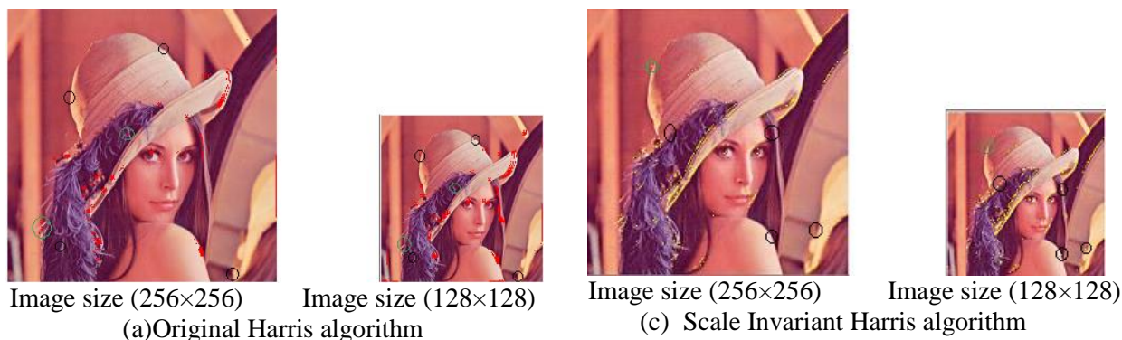
Figure 2: Missing Corner(s) in Lena image